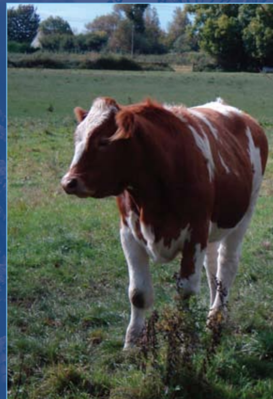
Farming on the Gwent Levels.

SGTL is committed to the protection of the environment and will employ every possible measure to reduce our environmental impact. The proposed route crosses an area of considerable nature conservation interest and SGTL will work with the relevant statutory authorities, and other stakeholders, to ensure we take all reasonable steps to conserve and enhance this important environment.