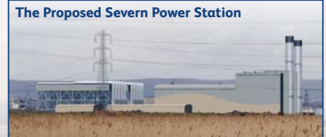
The Proposed Severn Power Station

Following the completion of construction works, disturbed land will be fully reinstated. Hedgerows will be replanted, and fences re-erected taking into account local styles and materials. Normal farming operations can be resumed as soon as reinstatement has been completed.