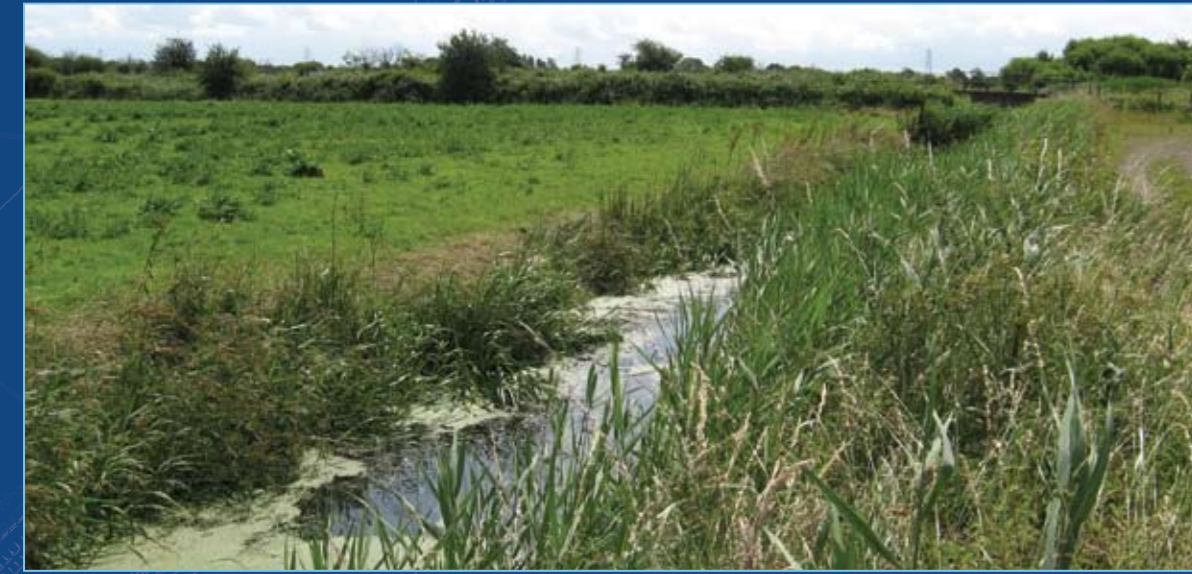
The Gwent Levels.

Severn Gas Transportation Ltd (SGTL) is a licensed gas transporter and will be responsible for the construction and operation of the Marshfield to Uskmouth pipeline. The pipeline will be constructed from welded steel pipe and will be buried up to 30m below the surface for its entire length. It will have an external diameter of 450mm / 18 in.