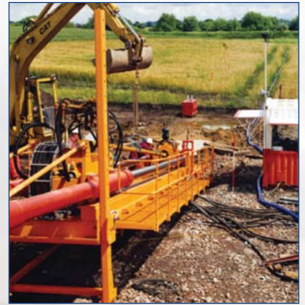
Drilling Site for a HDD Operation.